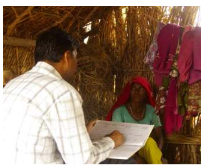
FHOs conduct assessments to identify the poorest and most vulnerable families.

To implement the FLRC initiative, ARAVALI has developed a tool 'Instrument of Engagement (IoE)', which is a matrix of qualitative and quantitative